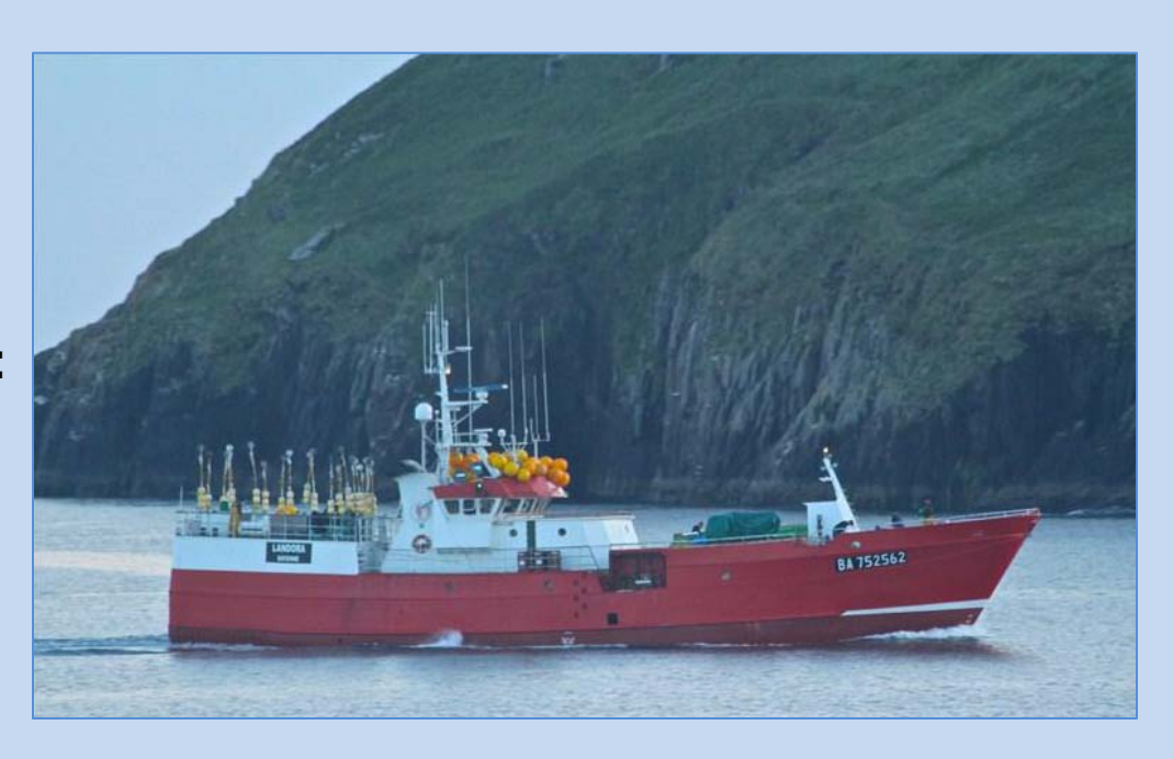
Zona de Pesca: Irlanda

"Everything all right. I am satisfied with the service. Every once in a while there is an interruption on the call but this is happenning less and less frequently. Speaking in general I would say the service is going well" 29-08-13